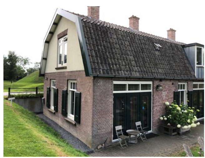
LekArt Air is located in the lower left floor of the fort keeper's house.